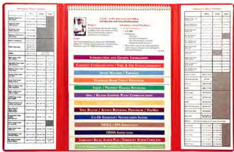
Large 9x12 Vinyl Guide

The clear pocket sets are made from polypropylene a highly durable archive quality material which resists sticking ink. The material is impervious to cleaning solutions.