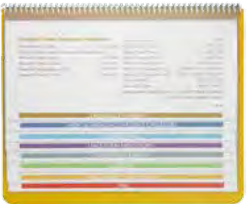
Small 9x7 Polyboard Guide