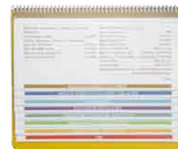
Small 9x7 Polyboard Guide (Ideal for Classroom and Bus)