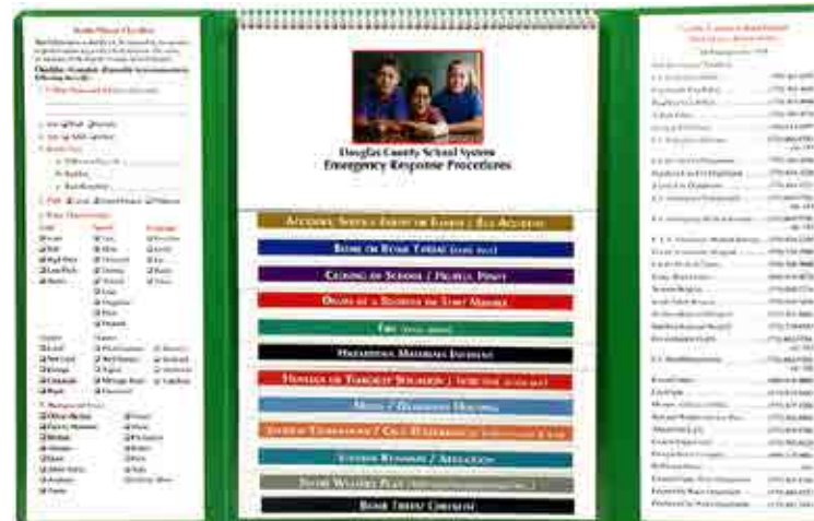
Large 9x12 Vinyl Guide (Ideal for Administration Guides)

The clear pocket sets are made from polypropylene a highly durable archive quality material which resists sticking ink. The material is impervious to cleaning solutions.