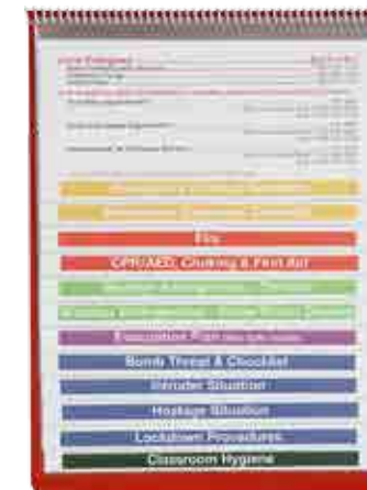
Large 9x12 Polyboard Guide