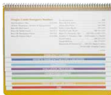
Small 9x7 Polyboard Guide