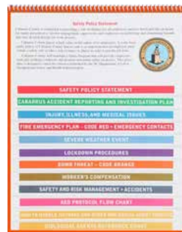
Large 9x12 Polyboard Guide